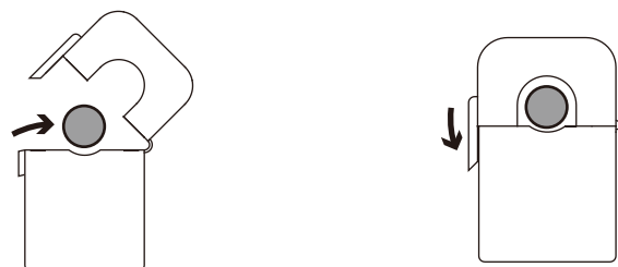
3. In the lead