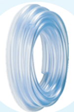
Wrinkle free tube