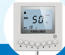
Optional Remote Control