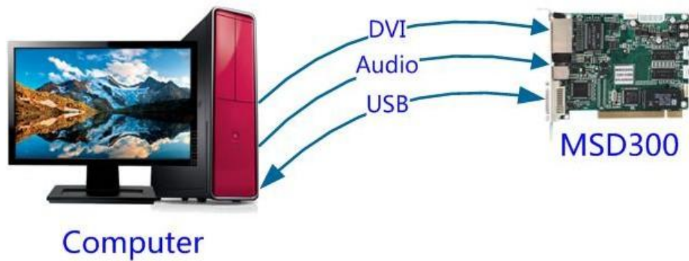
Fig. 2 MSD300 Connection diagram