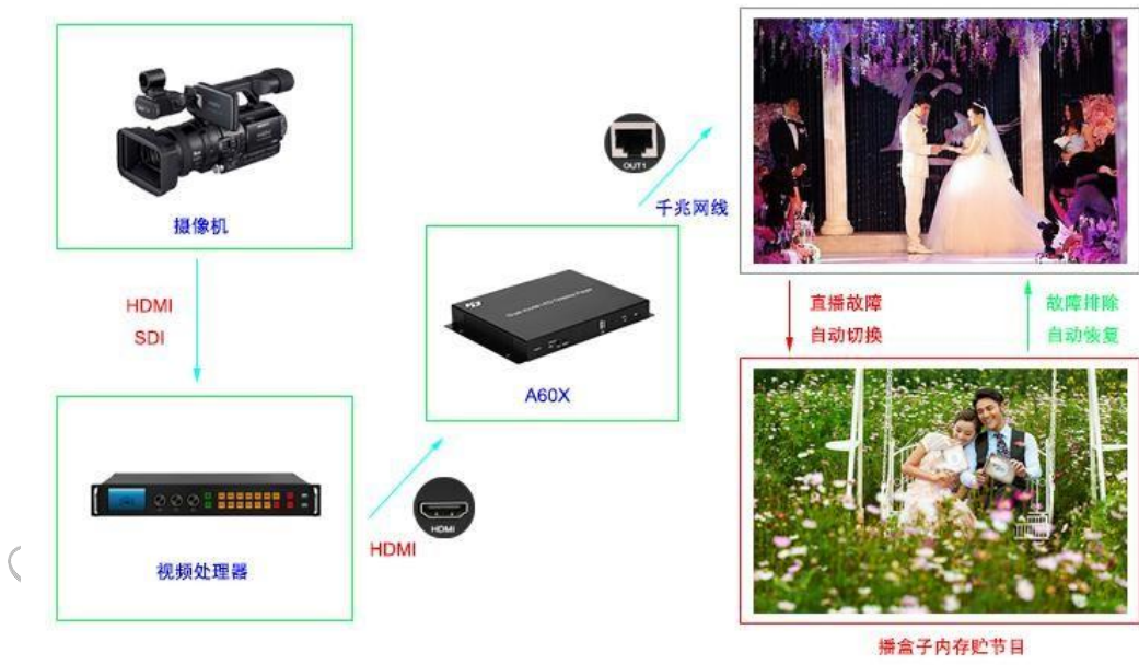
Display camera images synchronously