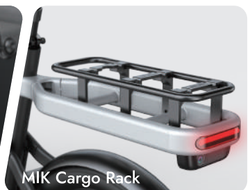
MIK Cargo Rack

Contact us: marketing@tarranbikes.com sales@tarranbikes.com www.tarranbikes.com