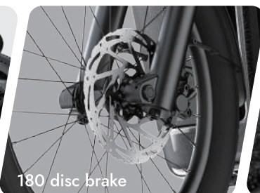
180 disc brake