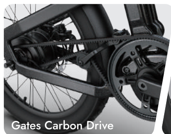
Gates Carbon Drive