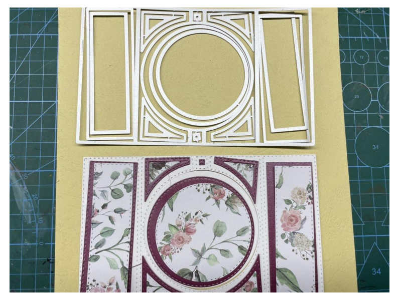
Step 2: Putting the parts together with liquid glue

Use different color cardstock to cut out the Collapsible Border Cutting Dies with a cutting machine