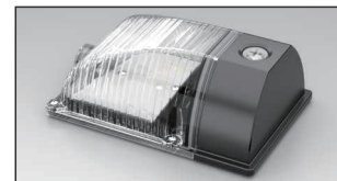
Die Casting Aluminum Heat Sink ADC12