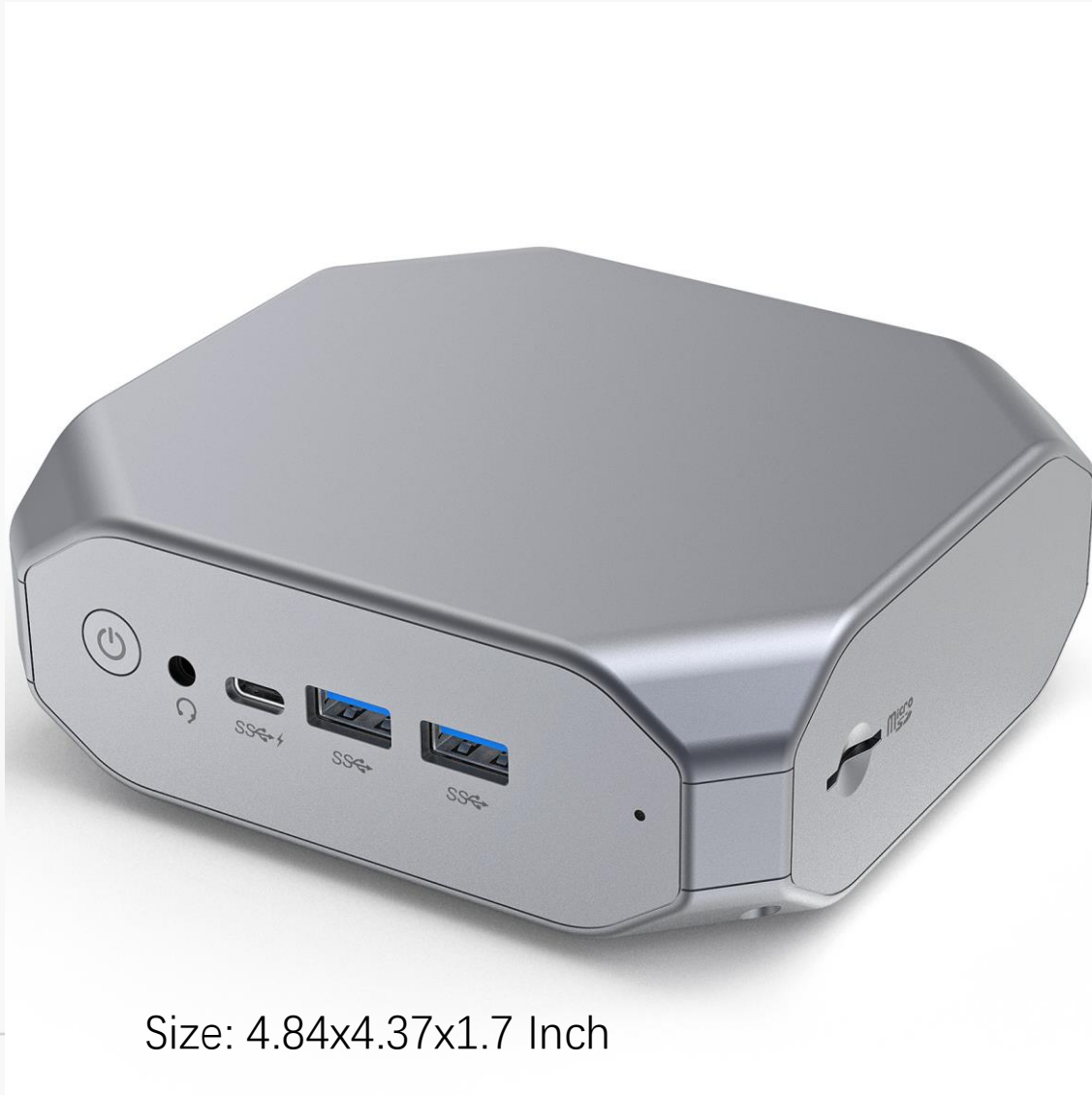
Size: 4.84x4.37x1.7 Inch