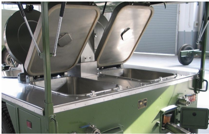
E: Staple food pans, cooking rice, soup, steaming, boiling and so on Pot size: 750×560×287mm ; volume: 105L/pc