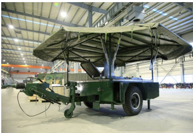
C: unfold show