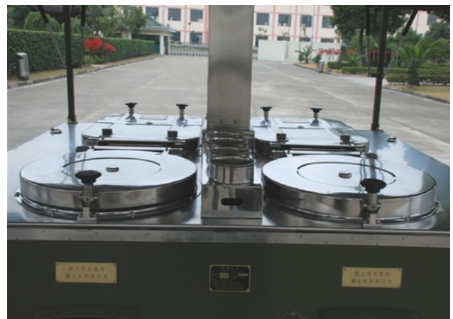
D: Whole equipment layout