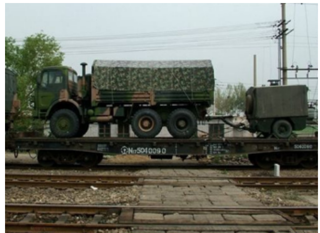
B: running situation