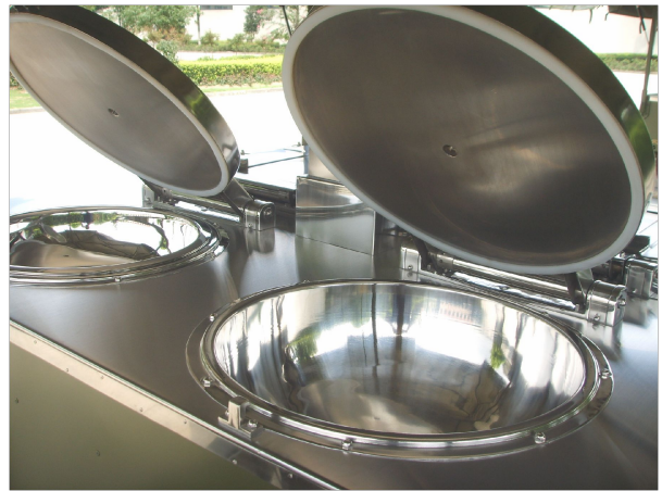
F: Non-staple food pans, cooking vegetables, stew, fry and deep-fry and so on Diameter: \phi 600 mm volume: 55L/pc