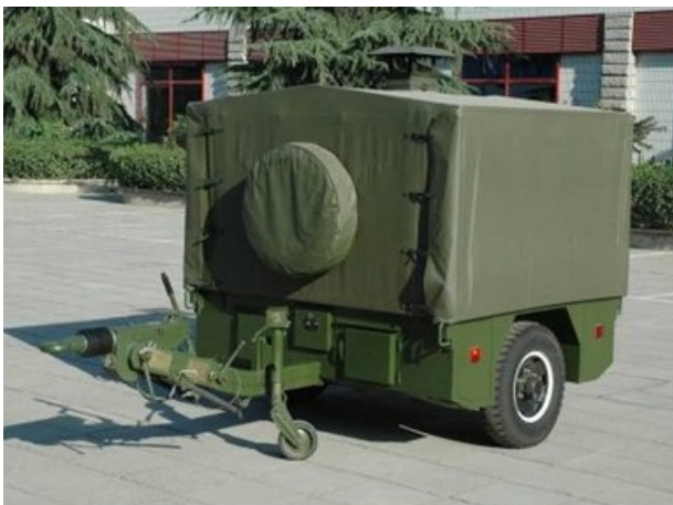
A: package situation 4M x 2.25M x 2.42M

It has the features of ground operation, adjustable traction height, traction suitable for various kinds of vehicles, good synchronous performance due to introduce the inertial brake system, fast unfolding and drawing-in of the tent, non-scorching appearance due to adopt inner immersion method for cooking rice.