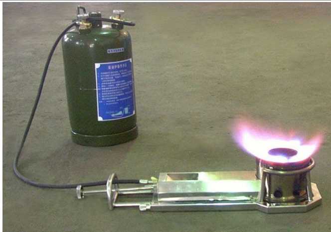
G: Diesel furnace burner and fuel tank assembly oil consumption: 1.6~2.1 kg/h work stress: 0.1~0.5Mpa reserve fuel quantity: 8L