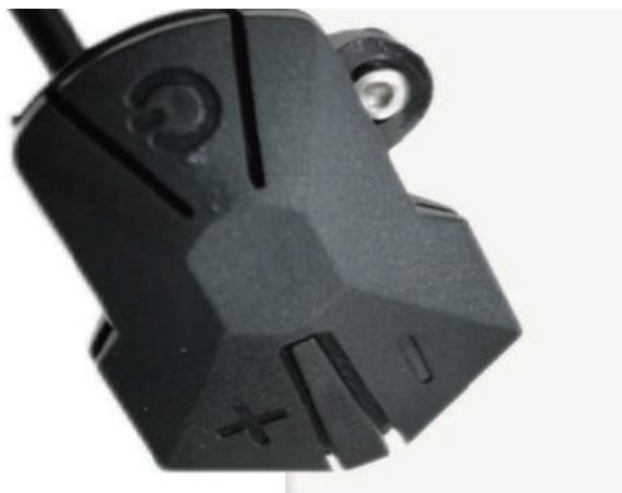
Table: Line sequence of the label connector table