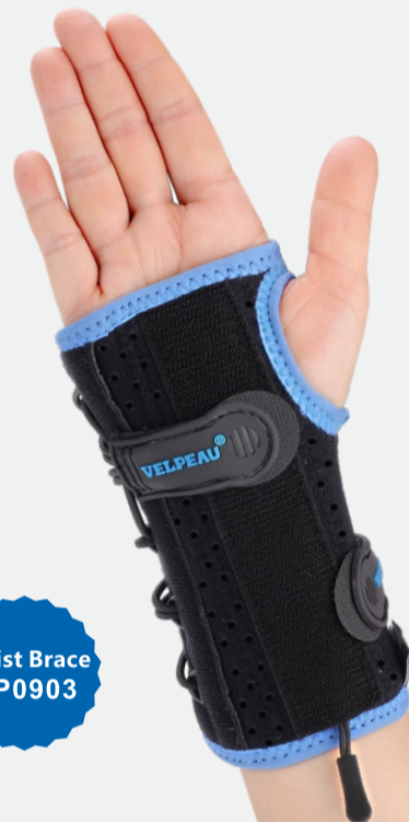
Wrist Brace VP0903