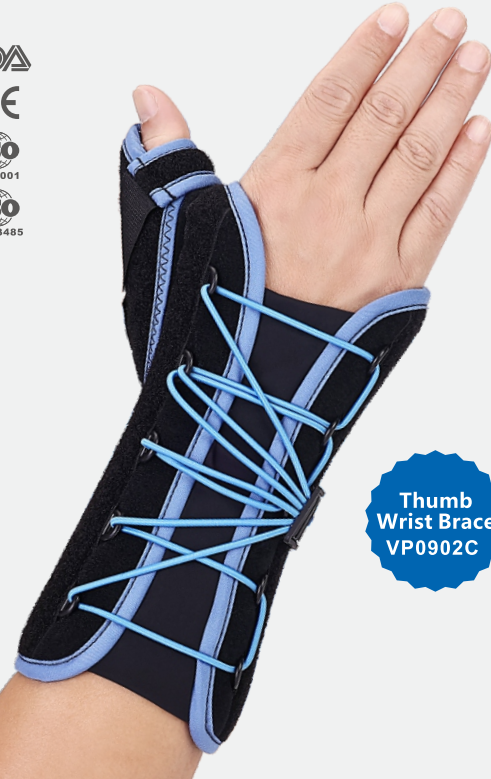
Thumb Wrist Brace VP0902C

[Product Name] : Thumb Wrist Brace ( Drawstring Version )