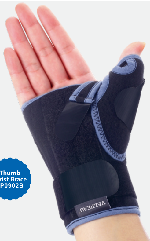
Thumb Wrist Brace VP0902B