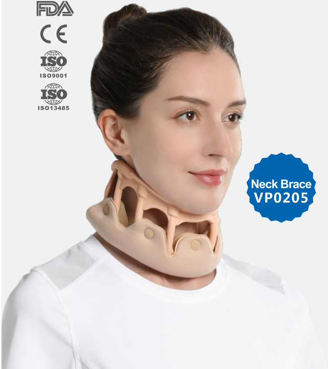
Neck Brace VP0205

[Product Name] : Cervical Collar - Silicone Version (Neck Brace)