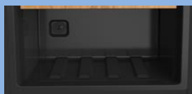
Internal fan & activated charcoal filter

LCD display and touch screen controls for each temperature zone