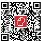
Dipet Life App

Search "Dipet Life" in App Store or Google Play. Download it and sign in.