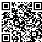
Scan code for tutorial