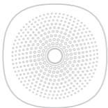
New-fresh Air Purifier*1

Due to the product update iteration, accessories may have some adjustments or changes. Real objects be taken as final.