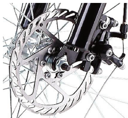
Typical Disc Brake

The brakes are operated by the rider through levers mounted to the handlebars. The left-hand lever operates the rear brake, the right-hand lever operates the front brake. The ability of the rider to adequately slow and/or stop the bicycle depends largely on the skill of the rider, the surface being ridden on and other factors such as rain, tyres, adjustment and condition of the brake parts etc