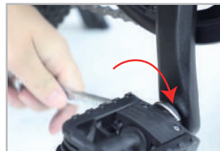
Rotate clockwise to tighten