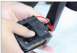
Installed on the chainwheel side crank