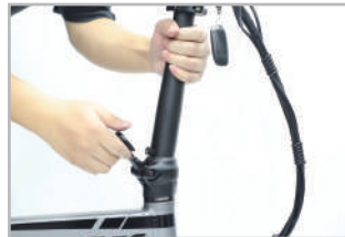
Screw on and Tighten