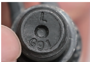
Looking for "L" mark