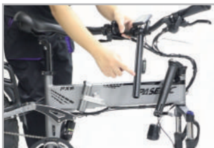
Put the handlebar on the stem