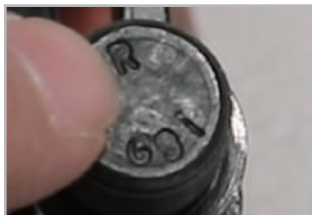
Looking for "R" mark