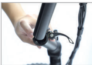
Move in the right direction