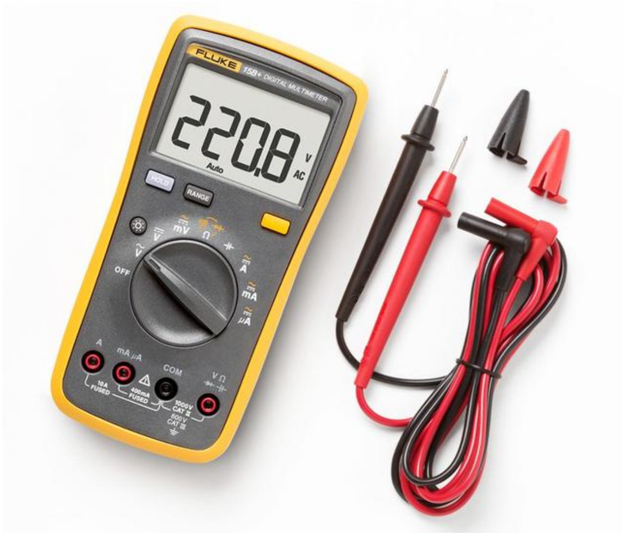
Fluke 15B+ 17B+ Digital Multimeters