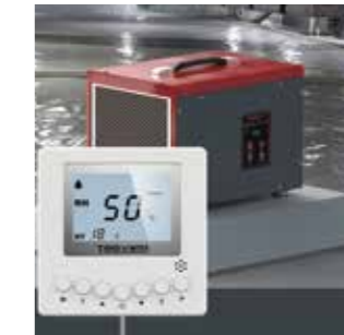
Optional Remote Control