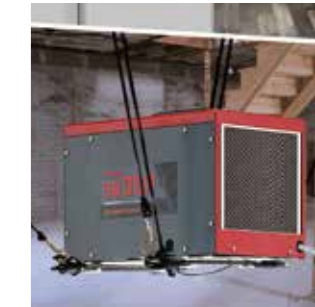
Optional Hanging Kits