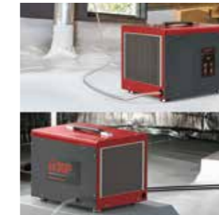
Pump drain / Gravity drainage

ALL our products are tested and proven to be fully operational before being released to the market. Our team of world engineers works tirelessly to ensure the Guardian SN35P unit will exceed your expectations.