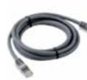
Remote Control (Optional) Cable