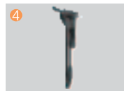
Insert the air needle into the air hole to pump air.