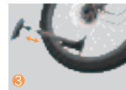
Hold the handle tightly and pull to pump up