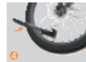
After pumping up, put away the handle and restore the lock