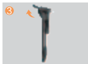
After installing the air needle, open the lock.