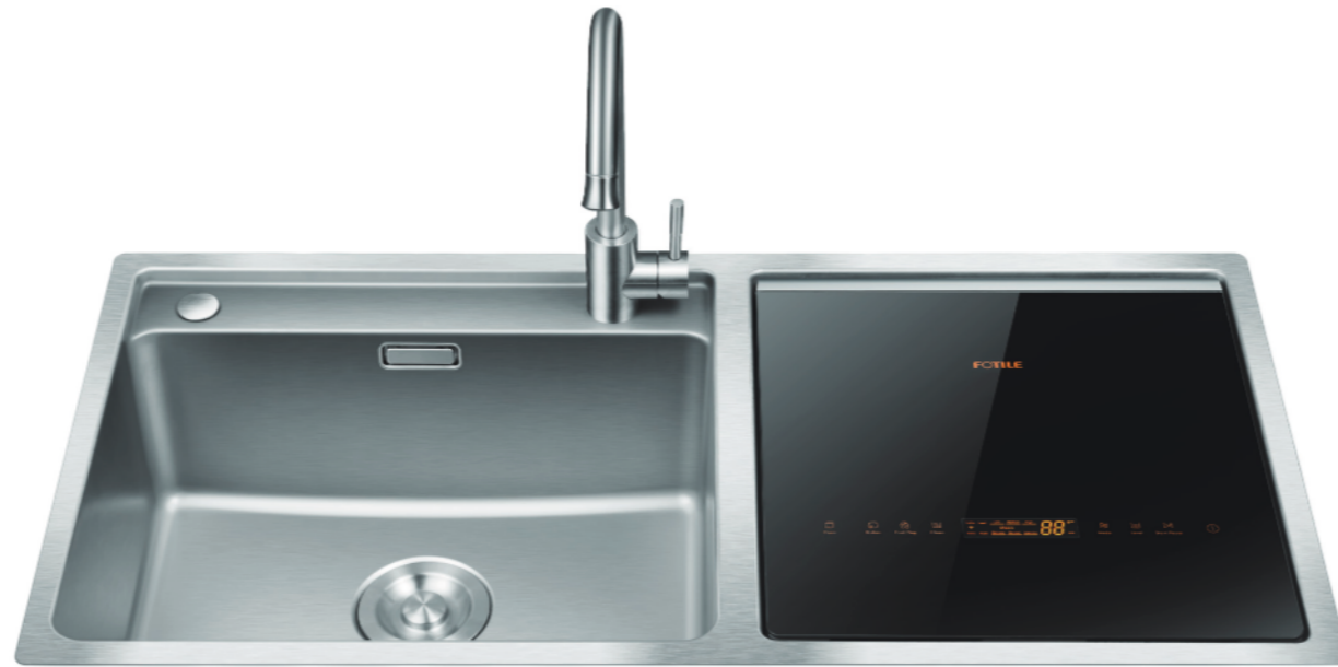
SD2F-P1X * Faucet is not included