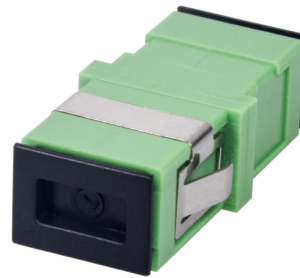
SC Fiber Optic Adaptor (Green)