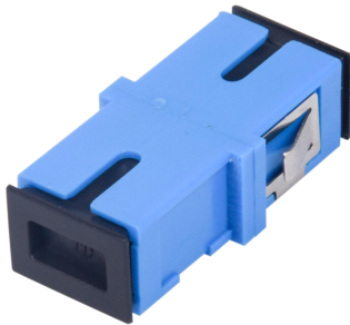
SC Fiber Optic Adaptor (Blue)