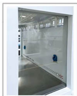
The Side Window