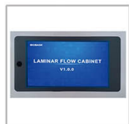
LED Display Digital LED Display: Airflow Level