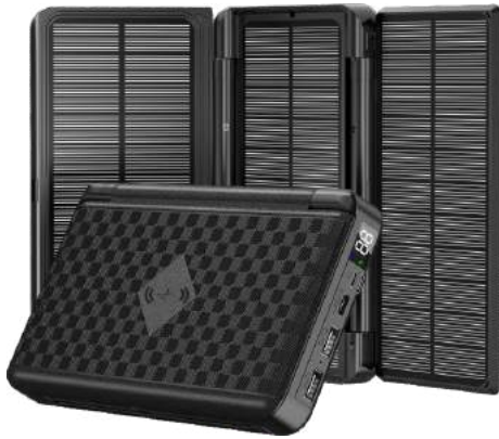
PN-W21 Foldable Soar Panel Charger