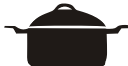
Magnetic Stainless Steel Pan