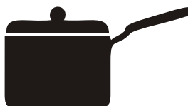
Magnetic Stainless Iron Pan

Please kindly follow the below requirements if use the vessel not listed.