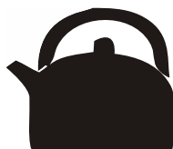
Stainless Steel Pot