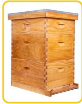
8 frame 3 layer