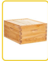
10 frame deep