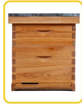
10 frame 2 layer