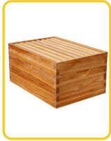
8 frame deep