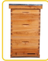
10 frame 3 layer