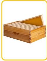
8 frame super