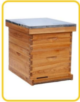
8 frame 2 layer