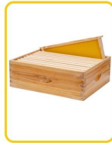
10 frame super