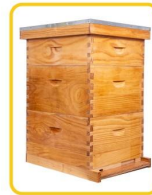
8 frame 3 layer