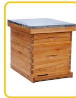
8 frame 2 layer