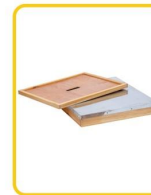
10 frame top and inner cover