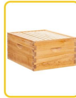
10 frame deep