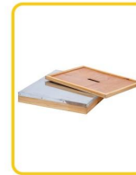
8 frame top and inner cover