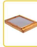
10 frame screened bottom board