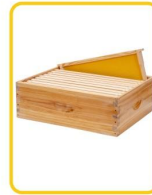
10 frame super