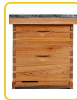
10 frame 2 layer