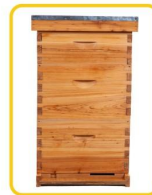
10 frame 3 layer