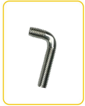
Shape L Screw*1 (Spare part)