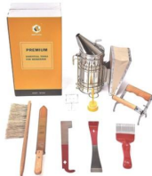
Beekeeping Basic Kit