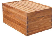
8-Frame deep box