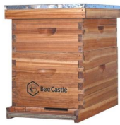
Beehive(1 Deep,1 Super)