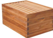
10-Frame deep box