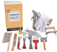
Beekeeping Pro Kit