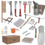
Beekeeping Tools Kit