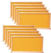
Deep Size Frame With Foundation(yellow)