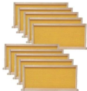
Medium Size Frame With Foundation(yellow)