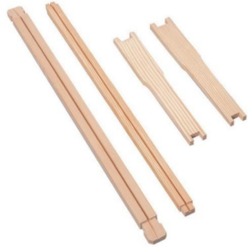
10 * Quality Frames