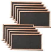
Deep Size Frame With Foundation(black)