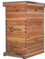
Beehive(2 Deep,1 Super)