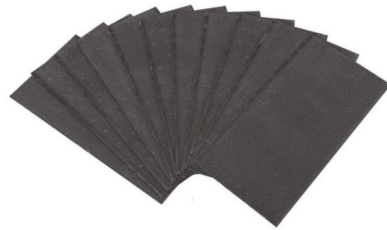
10 * BeesWax Coated Foundation Sheets (Yellow or Black depending which color did you purchase)