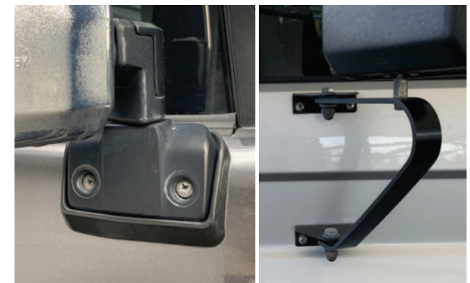
76 & 78 SERIES

You will need to fit the supplied rubber pads to your mirrors prior to installing the mirrors to your vehicle.