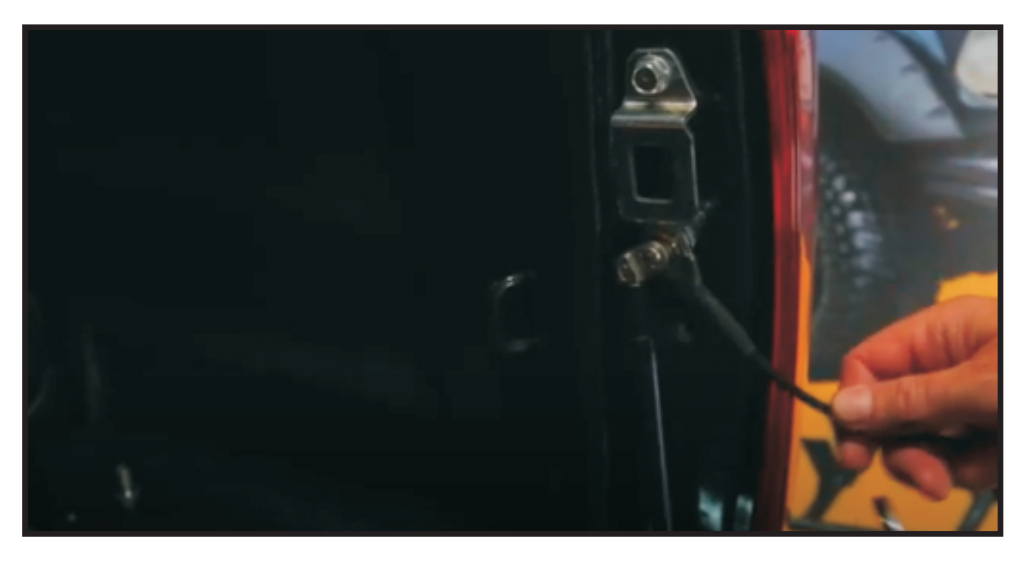
10. Fit the lower bolt hole of the door strike bracket (removed in step 6).