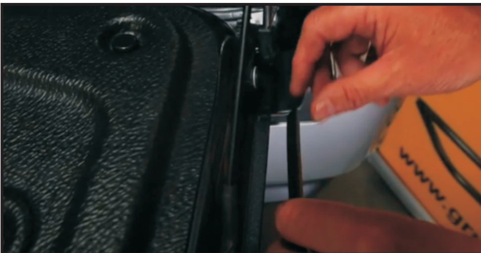
14. Stick the locating rubber as shown.