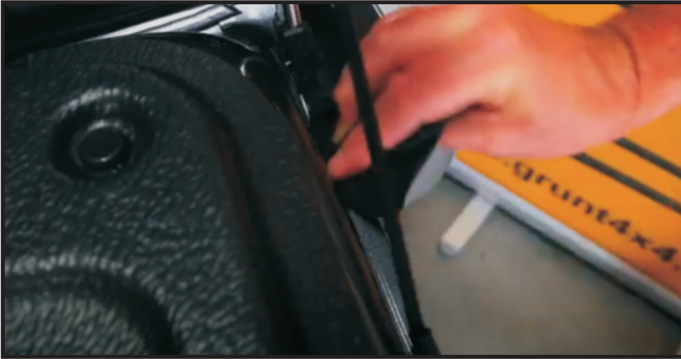
13. Clean the tailgate lip as shown.