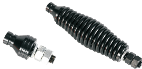
2 x Flag Bases