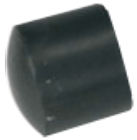
2 x Caps