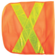
1 x Fluorescent Flag