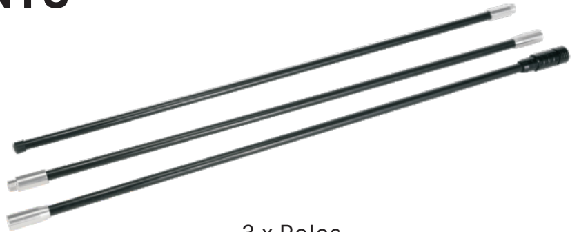
3 x Poles