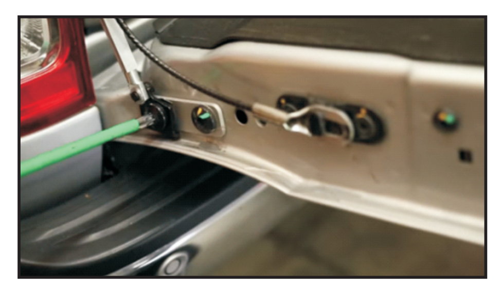
Repeat the same steps for the passenger's side.