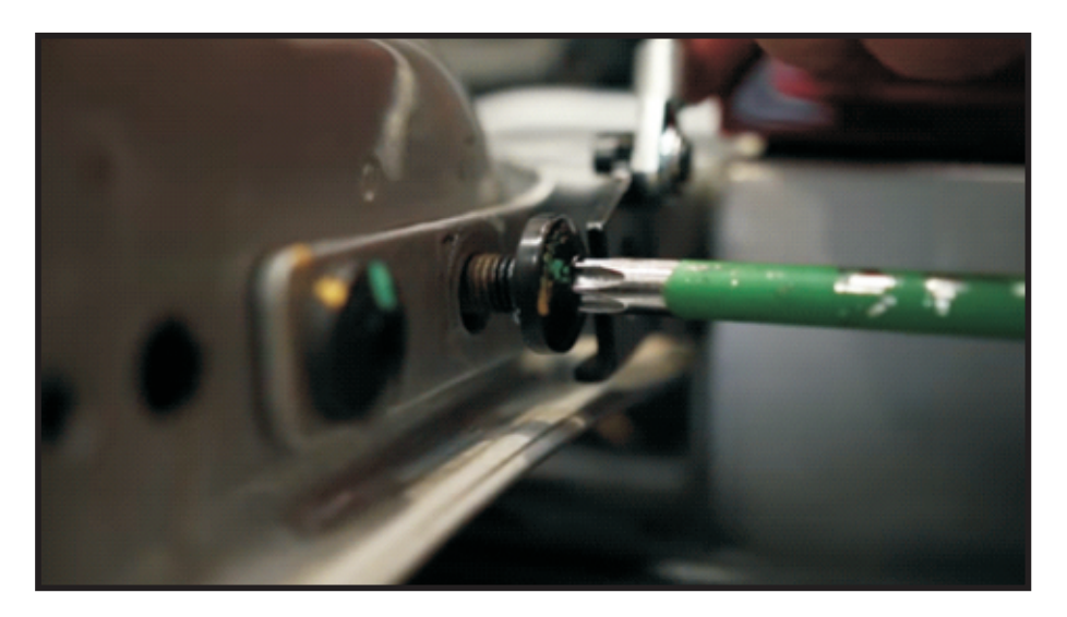
Remove the bolt that nears the body.