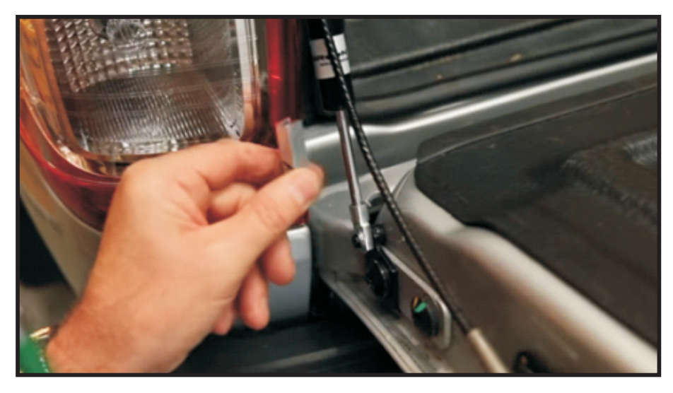
The spacer should not be removed before installation is finished.