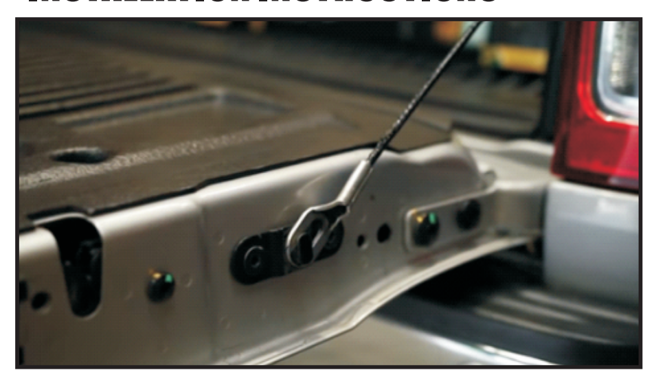
Temporarily remove the cable from the tailgate.