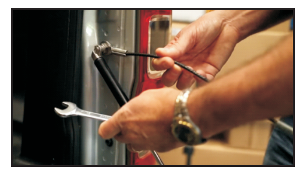
Place the strut to the body with cable attached.