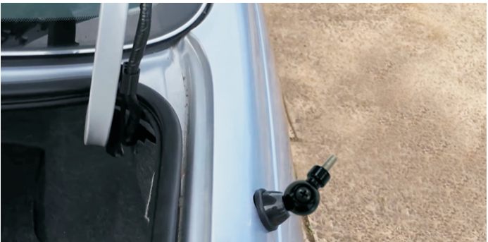
Install and tighten the rubber antenna 4.