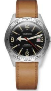
SKINDIVER WT AUTOMATIC Ø 40MM | AUTOMATIC – Equipped with a sapphire crystal and automatic movement, designed for watch enthusiasts who appreciate elegance and performance. NEW! Now with 60 hours power-reserve.