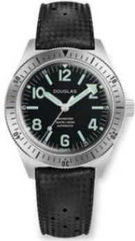
NEW! SKINDIVER PROFESSIONAL Ø 40MM | AUTOMATIC – Equipped with a Hesalite glass and an automatic movement, this is the perfect re-edition of the ubiquitous skindiver tool-watches of the 1960s and the 1970s.