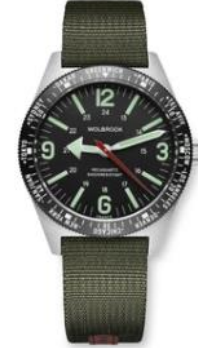
SKINDIVER WT MECAQUARTZ Ø 40MM | QUARTZ WATCH – With a flat sapphire crystal and a sweep second mecaquartz movement, this is the perfect interpretation for the everyday adventurer.