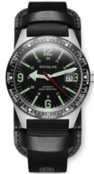
SKINDIVER WT PROFESSIONAL Ø 40MM | AUTOMATIC – Sporting a Hesalite double-dome glass and automatic movement, this is the most faithful version for the space exploration golden age fan. NEW! Now with 60 hours power-reserve.