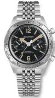
SKINDIVER WT CHRONO-MECAQUARTZ Ø 40MM | CHRONOGRAPH – With a glass box sapphire crystal and a chronograph mecaquartz movement, this stop-watch is the perfect mix of technicity and sophistication.