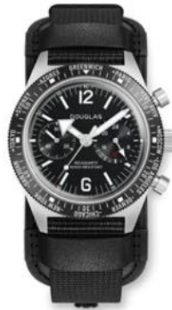
SKINDIVER WT PRO CHRONO-MECAQUARTZ Ø 40MM | CHRONOGRAPH – With an Hesalite glass and a chronograph mecaquartz movement, this big eye stop-watch is the absolute blend of time-keeping technicity and legibility.