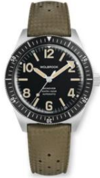
NEW! SKINDIVER AUTOMATIC Ø 40MM | AUTOMATIC – Outfitted with a sapphire crystal and an automatic movement, this is the modern version of the iconic skindiver watches of the 1960s and the 1970s.