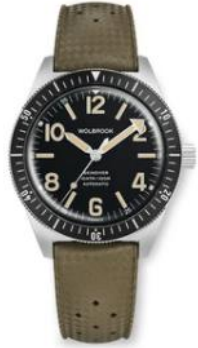
NEW! SKINDIVER AUTOMATIC Ø 40MM | AUTOMATIC – Outfitted with a sapphire crystal and an automatic movement, this is the modern version of the iconic skindiver watches of the 1960s and the 1970s.