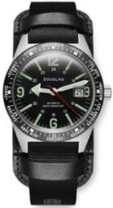
SKINDIVER WT PROFESSIONAL Ø 40MM | AUTOMATIC - Sporting a Hesalite double-dome glass and automatic movement, this is the most faithful version for the space exploration golden age fan. NEW! Now with 60 hours power-reserve.