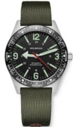
SKINDIVER WT MECAQUARTZ Ø 40MM | QUARTZ WATCH - With a flat sapphire crystal and a sweep second mecaquartz movement, this is the perfect interpretation for the everyday adventurer.