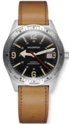
SKINDIVER WT AUTOMATIC Ø 40MM | AUTOMATIC - Equipped with a sapphire crystal and automatic movement, designed for watch enthusiasts who appreciate elegance and performance. NEW! Now with 60 hours power-reserve.