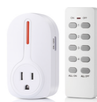
Remote Control Outlets