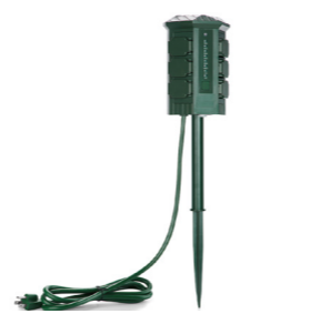
Outdoor Power Stakes