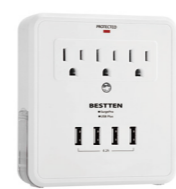
USB Wall Outlet Surge Protectors

For more products from BESTTEN, please visit our website www.ibestten.com