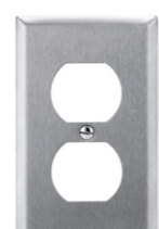
Stainless Steel Wall Plates