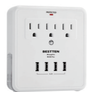
USB Wall Outlet Surge Protectors

For more products from BESTTEN, please visit our website www.ibestten.com