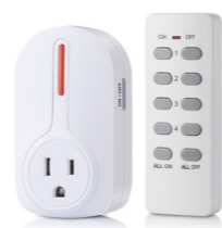
Remote Control Outlets