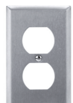
Stainless Steel Wall Plates