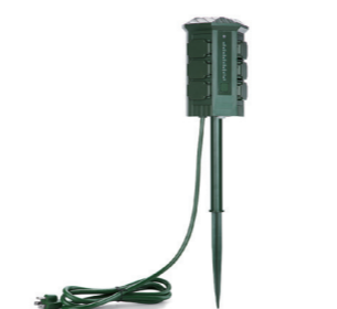
Outdoor Power Stakes