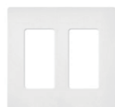
Screwless Wall Plates