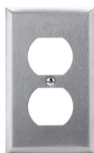
Stainless Steel Wallplates