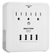
USB Wall Outlet Surge Protectors

For more products from BESTTEN, please visit our website www.ibestten.com