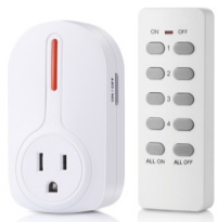
Remote Control Outlets