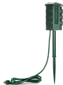
Outdoor Power Stakes