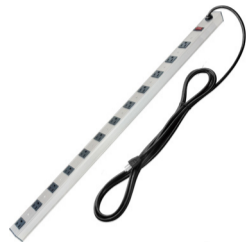
Metal Power Strips