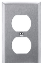
Stainless Steel Wallplates