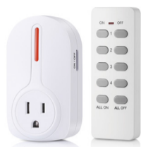
Remote Control Outlets