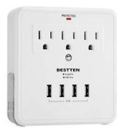
USB Wall Outlet Surge Protectors

For more products from BESTTEN, please visit our website www.ibestten.com