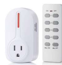
Remote Control Outlets