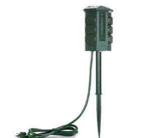
Outdoor Power Stakes