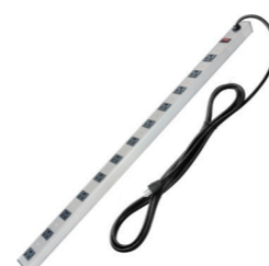
Metal Power Strips