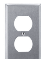
Stainless Steel Wallplates