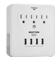
USB Wall Outlet Surge Protectors

For more products from BESTTEN, please visit our website www.ibestten.com