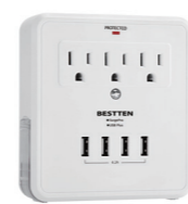
USB Wall Outlet Surge Protectors

For more products from BESTTEN, please visit our website www.ibestten.com