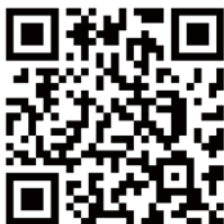
QR Code for Official Website www.isolarparts.com

Website: www.isolarparts.com Email: Philip@isolarparts.com