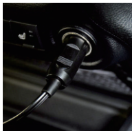
Cigarette lighter plug