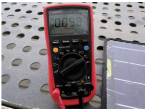
Voltage test Electrical current test