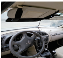
Securing the solar panel to a sun visor Wiring the Solar Panel