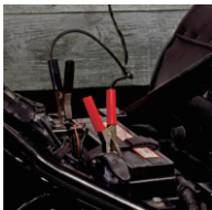
Crocodile clamps connected