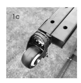
Pay attention to the direction of wheel and the carner post.