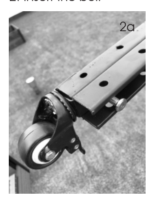
2. Insert the bolt