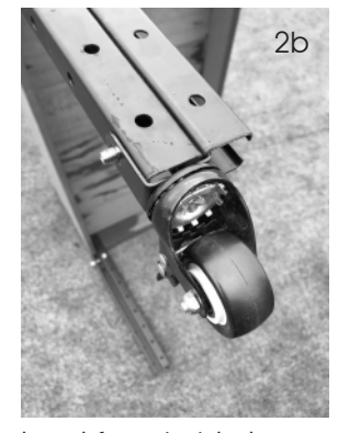
Insert from inside to outside.