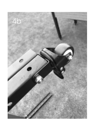
Please use a 5mm hex wrench and a 13mm combination wrench

5. Assemble the remaining wheels using the same method. The direction of each wheel aligns with the corner posts, as shown in Pictures 1c and 5a.