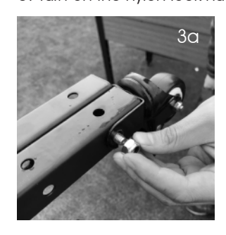
3. Turn on the nylon lock nut